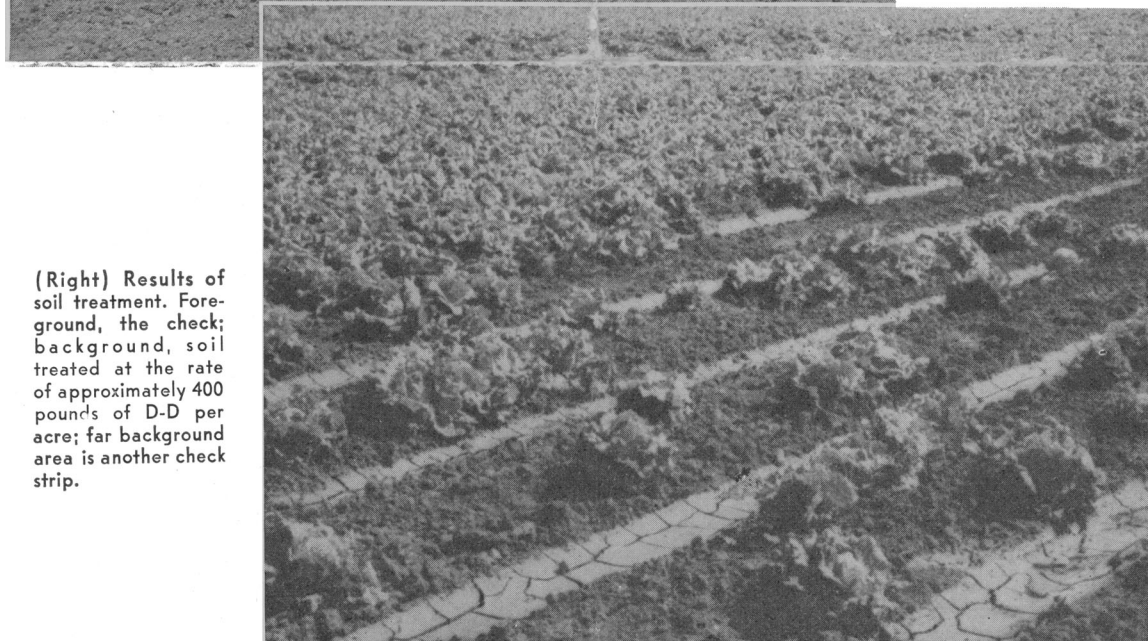
(Right) Results of soil treatment. Foreground, the check; background, soil treated at the rate of approximately 400 pounds of D-D per acre; far background area is another check strip.

and observations have been accomplished with the new chemicals for soil application but their full effects on all types of plants—their lasting qualities and their possible penetration within the plants and movement in the soil—are not fully known at this time.