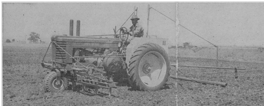
(Left) Applicator for applying soil fumigants. A series of drills are mounted on the front tool bar.

As with ethylene dibromide this material should be applied prior to planting a crop, and because of its