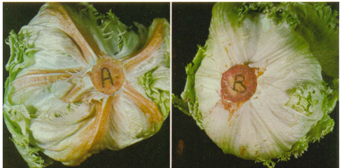
"Rusty rib" visible on Climax variety of head lettuce (A) above left—after seven days of storage at 35° F—contrasts sharply with resistant varieties: Forty-Niner (B) above right . . . Golden State D (C) below left . . . and Vanguard (D) below right . . . all showing no symp-