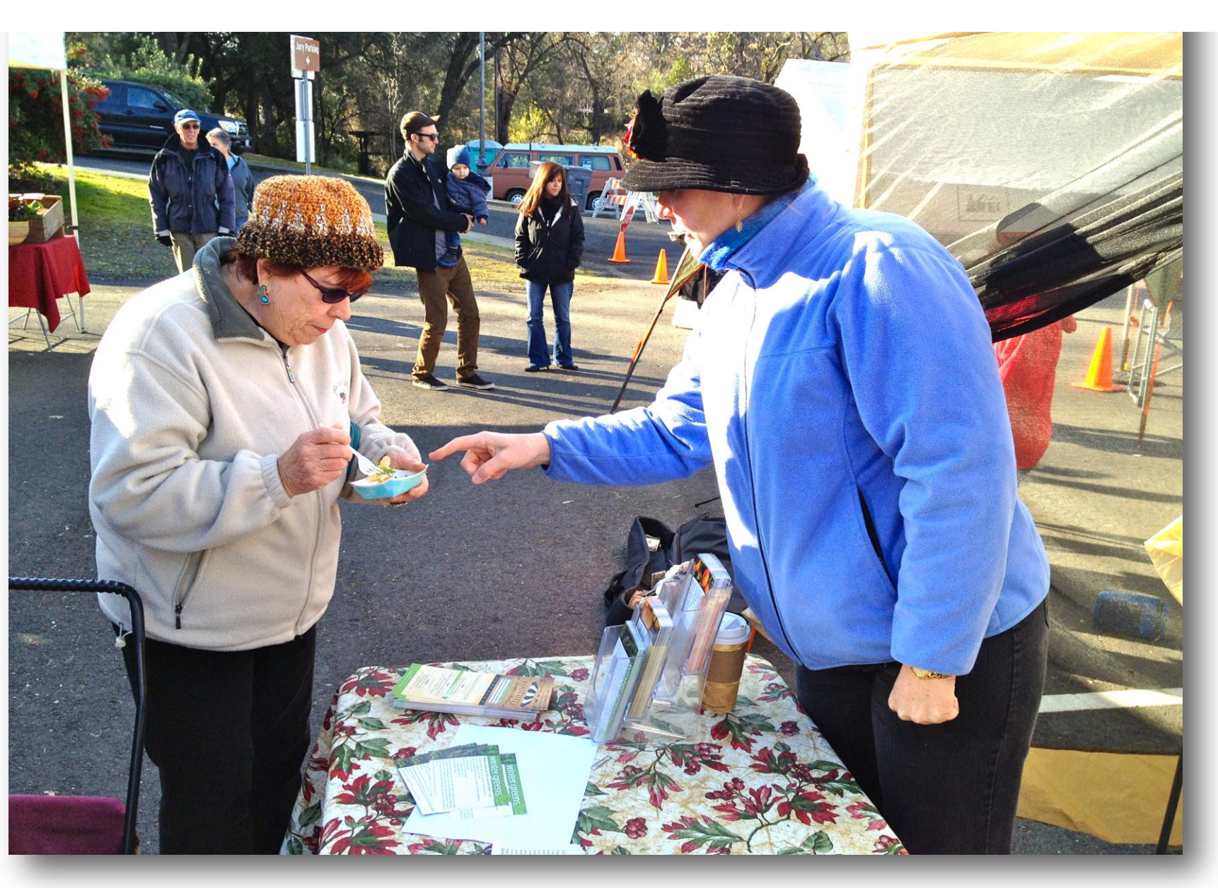
Consumers taste a local product, take a recipe card, learn which farms at the market sell the ingredients, and receive a $5 voucher to help purchase produce.

Winter squash sales increased 191% as a result of the tasting; cabbage sales increased 174%.