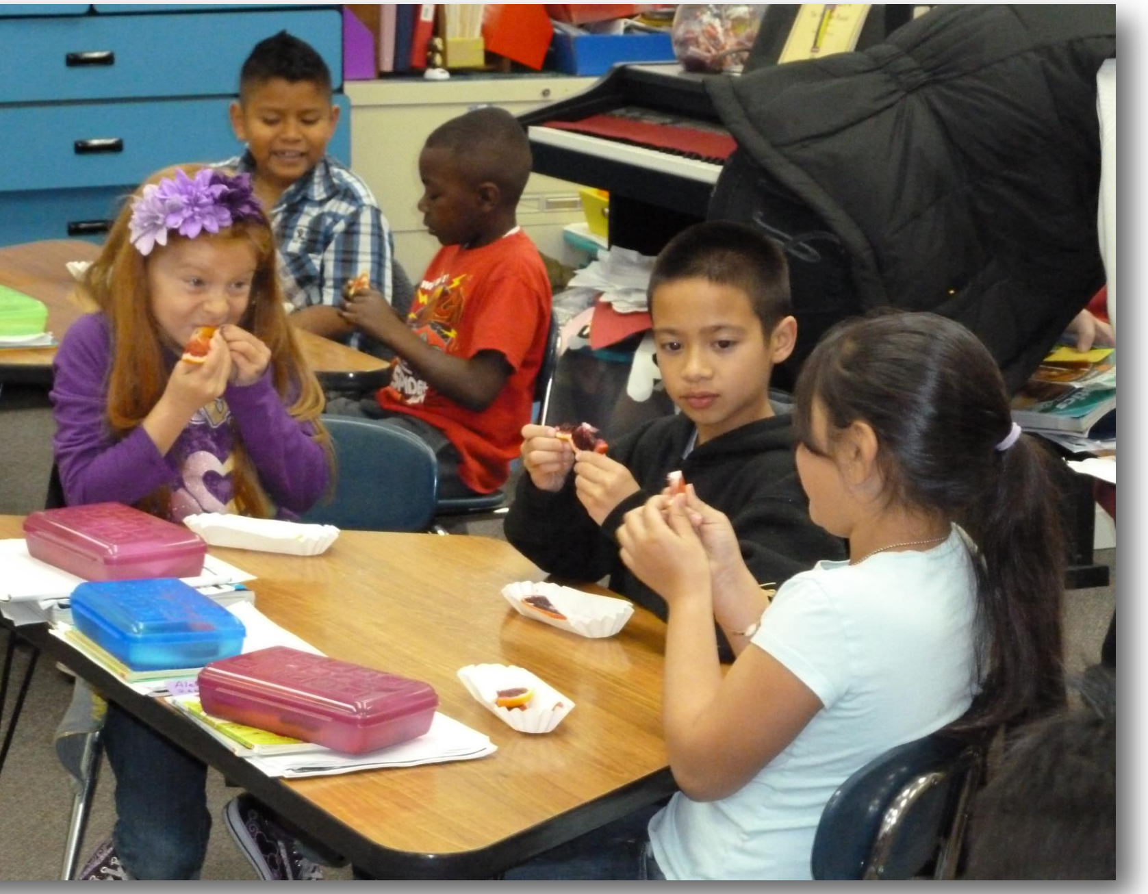
Sampling of blood oranges at Auburn Elementary in Auburn, CA

One sampling occurred at the Placer County Senior Center. 19 samples of butternut squash soup and 18 produce vouchers were handed out.