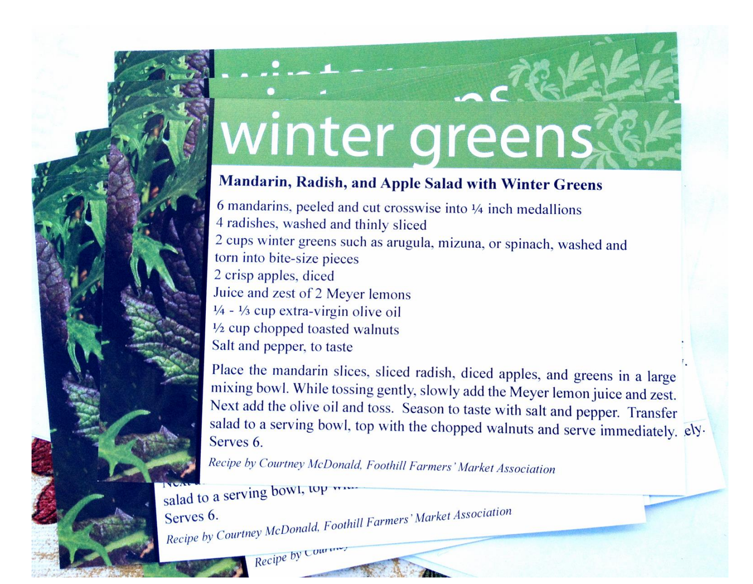
Recipe cards are developed for the highlighted crop that includes nutritional information