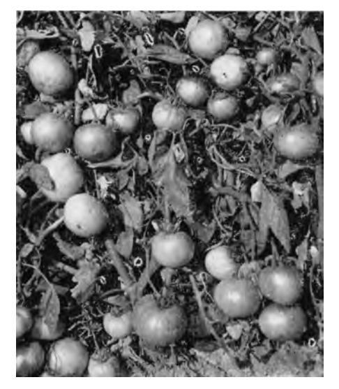
UC Hybrid 2. Staked plants photographed near Santa Ana July 8, 1955. Many pink and red ripe fruits had been previously removed in two pickings. Total height of growth 20–24".

were discontinued after five weeks because the harvests of all lines dropped to very low levels for a long period thereafter.