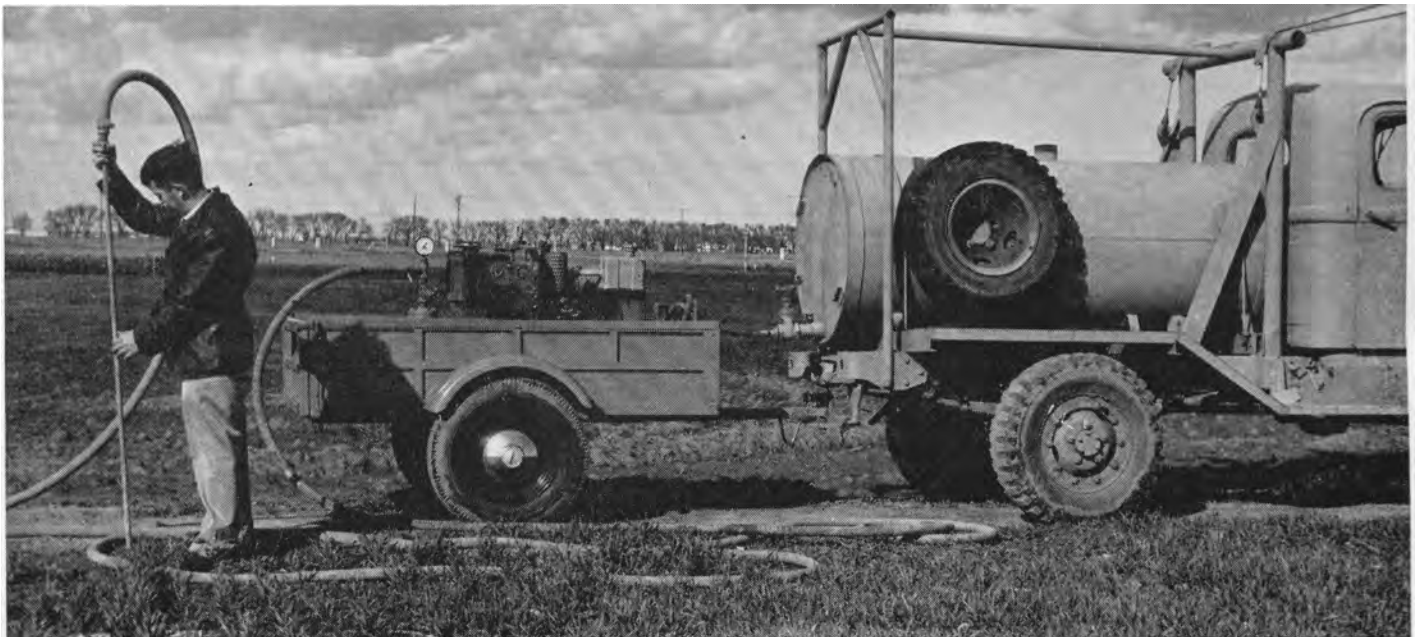
Equipment used for jetting piezometer in soil drainage investigation.