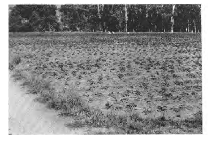
CALIFORNIA AGRICULTURE, JUNE, 1956