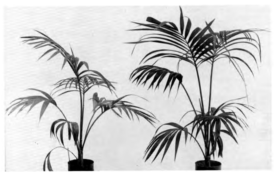
CALIFORNIA AGRICULTURE, JULY, 1956

Kentia paim. Left: grown in unfiltered, standard glasshouse; Right: grown in carbon-filtered, standard glasshouse; at Riverside.