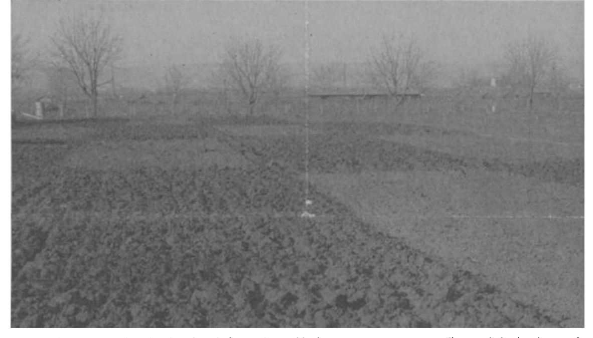
Partial view of the plowed and unplowed plots in the seed-bed preparation experiment. The rough land indicates the plowed plots, later cultivated to finely pulverized seed-bed. The light areas indicate the unplowed plots, which have been disked about two inches deep, floated, and made ready for seeding the crop.

Even though the plowed land had been harrowed and rolled, there was same in yield, sugar content, purity, treatments; (1) The soil was not a tendency to deeper planting be-