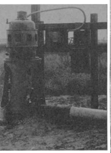
A 2-stage 12-inch turbine pump on a 12-inch well with a 55-ft. lift and a 20-ft. drawdown, to discharge 920 gallons a minute. Well is in Yolo County.

Result of Lowered Water Level During a period of low rainfall. less than the normal amount of wa-