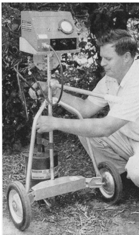
Portable neutron rate meter mounted at convenient working height on a golf cart. The probe and shield are located at the bottom of the cart.