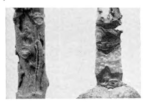
Orange tortrix injury. Left—girdled twig, showing larva; right—girdled stem of a fruit.

In one row of trees—approximately of the same size—six trees were sprayed for control of avocado brown mites with 50% TDE—also known as DDD—wettable powder and 15% Aramite wettable powder each at two pounds per 100 gal-