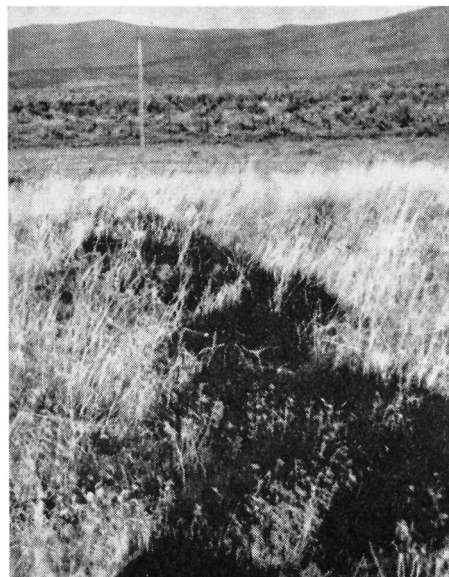
Third year growth response to nitrogen. Area in the foreground was fertilized with 1,000 pounds of 16-20-0 on November 2, 1954. Photo was taken on May 7, 1957. Unburned sagebrush range is in background.

sponse to carryover nitrogen in the plot fertilized the year before. The plot was harvested by mowing two strips 21" x 10' from each 15' x 15' plot on July 25, 1956. The forage had reached a mature dry stage. The samples were oven dried and weighed to the nearest gram. Separations of species were made by hand and crude protein content was determined.