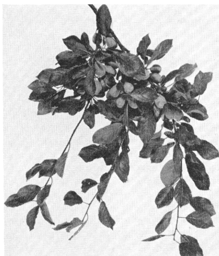
Normal French prune shoots.