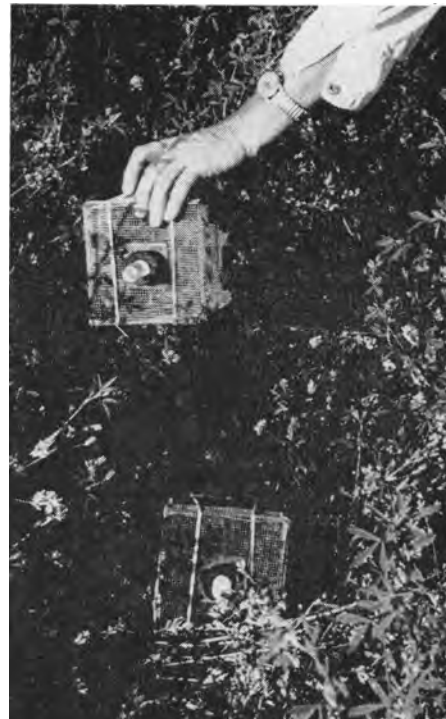
Placing cages of bees in an alfalfa field where spray will be applied.

The materials in Group 2, although highly toxic, can be used around honey bees because of certain characteristics they have. TEPP and Phosdrin have such short residual activity they kill only the