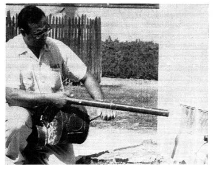
Application of dust. Left—with rotary duster through sub-floor vents for ant and cockroach control. Right—with a hand duster beneath sink.