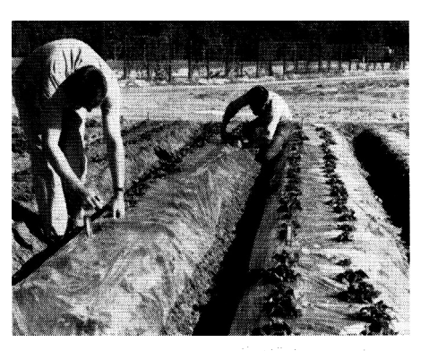
Strawberry plants are brought through slits in polyethylene bed covers by hand.

ered with clear, black, opaque, metallic and polyethylene impregnated paper were compared with bare beds. Daytime soil temperatures 3" below the soil surface were recorded with clinical thermometers at hourly intervals from 8:00 a.m. to 5:00 p.m. one day a week at each location from February through July. Plot yields were obtained from March through July.