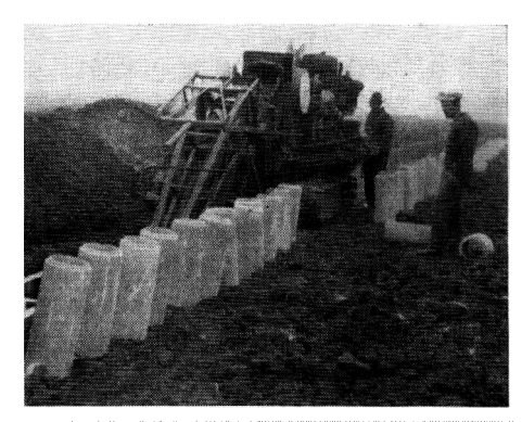
Installing concrete tile drainage system.

Investigation indicated that an interception type drainage system would be necessary to handle the problem. Consequently, 20,000' of main line 30" and 36" diameter monolithic concrete pipe was laid in November, 1958, to discharge