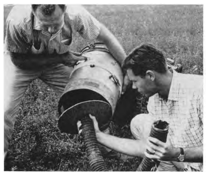
Placement of adapter hose for complete sampling.