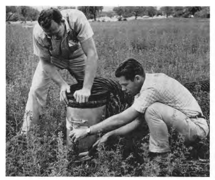
Cutting alfalfa encircling the nozzle of sampling machine.