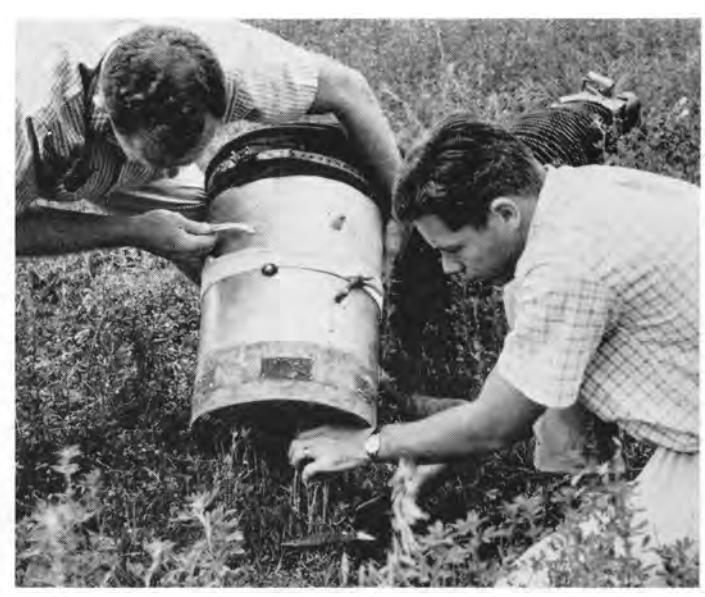
Clipped stems within nozzle shaken to loosen insects.