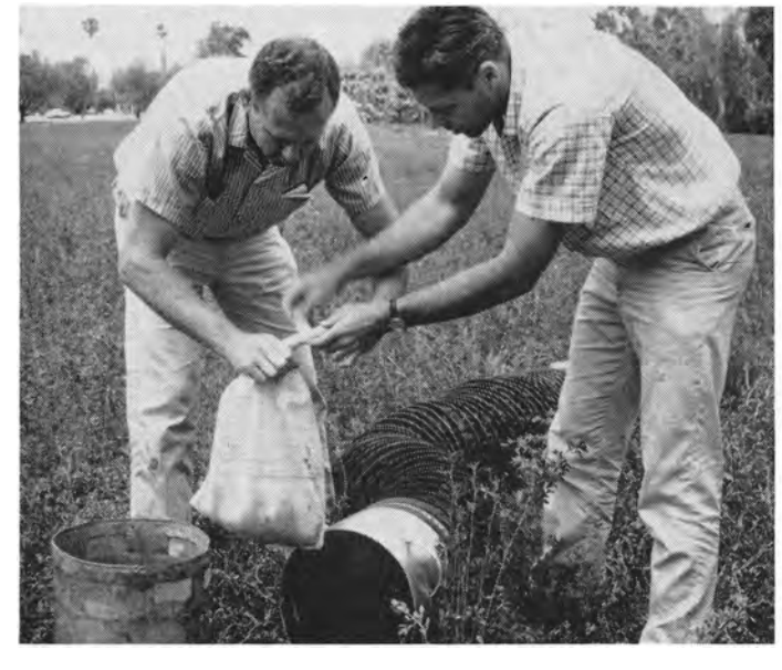
Collection bag is sealed quickly to prevent escape of insects.