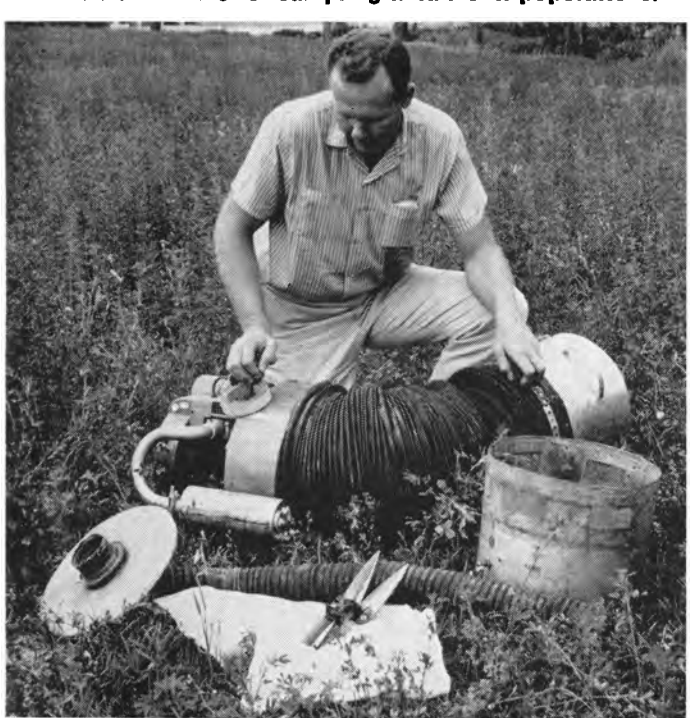
Method of moving machine between sampling areas.