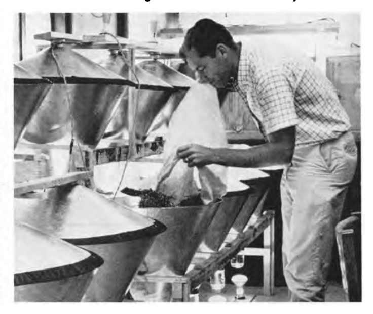
Anesthetized insects put into separators for counting.