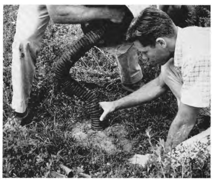
Increased suction through smaller hose lifts heavy insects.