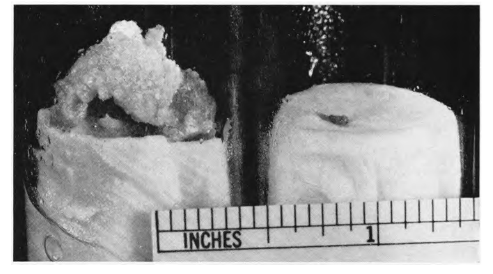
Left—Proliferating cell mass from stalk of lemon juice vesicle. Right—Juice vesicle which did not grow.

Tissue disks from the rind of nearly mature citron fruits begin to grow by cell