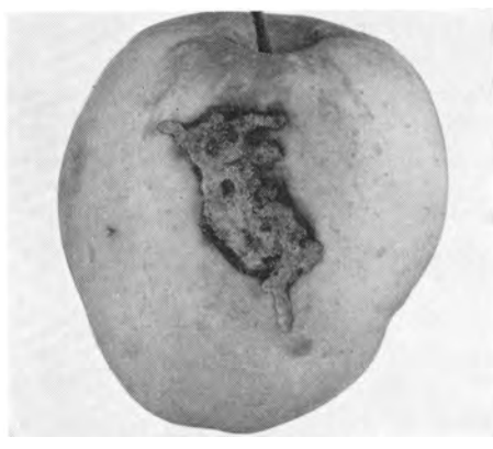
Damage to apple.