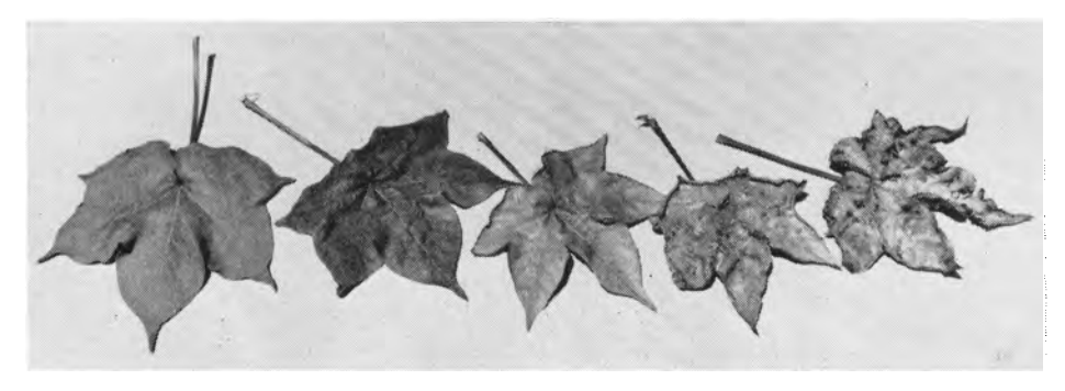
A normal cotton leaf on the left and progressively severe potassium deficiency symptoms to the right.