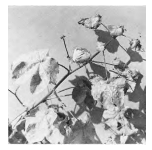
The upper portion of a cotton plant deficient in potassium.

toms and potassium levels in the petioles have been confirmed—almost without exception—in nearly 300 samples taken over a wide area during the late summers of 1958 and 1959.