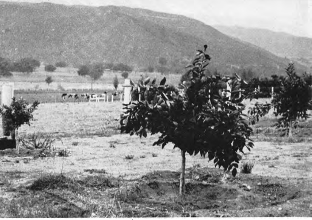
A group of trees—Washington Navels on Troyer citrange rootstocks—of same age: left, tree in untreated soil; center, in soil treated with 9 ounces of 85% Mylone in basin of 50 square feet; right, in soil treated with a pint of Vapam in the basin of 50 square feet.

The average increment of growth in circumference of the trees in the dis-