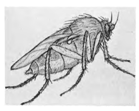
Adult Phorid fly.

The program developed did not depend on chemicals or insecticides alone. Cultural and mechanical methods were taken into consideration and modified. The working area was cemented and periodically swept clean with a machine similar to a street sweeper. The surrounding areas were sprayed with dieldrin after the trash and weeds were removed. Deodorizing chemicals were atomized into the air, high above the buildings, to cut down the odors arising from the composting piles. These operations have de-