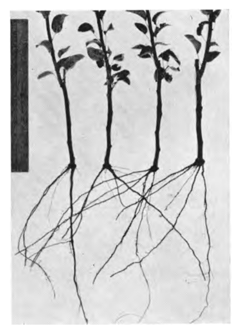
Root system produced by the Old Home pear nursery trees. July 19, 1960.

On July 5, 1960, counts were made of the cuttings which had developed into vigorous nursery trees. Best rooting of Old Home pear cuttings occurred when they were taken in mid-November. treated with IBA at 200 ppm, held in damp peat moss at 65°-70°F for about three weeks, then planted. Cuttings taken December 15 and January 15 also rooted but in lower percentages. A concentration of 200 ppm of IBA consistently gave higher percentages of rooting than either