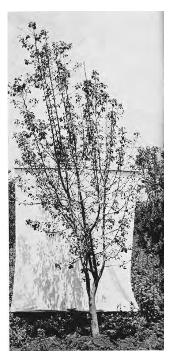
Left: Old Home tree showing severe decline, inally propagated on quina

On July 19 the soil was washed away from the roots of five sick trees and five healthy trees by the use of water from a high pressure sprayer. After the roots were washed clean, the walnut-brown bark of Old Home roots and their position above the bud union distinguished them from the blackish-brown quince