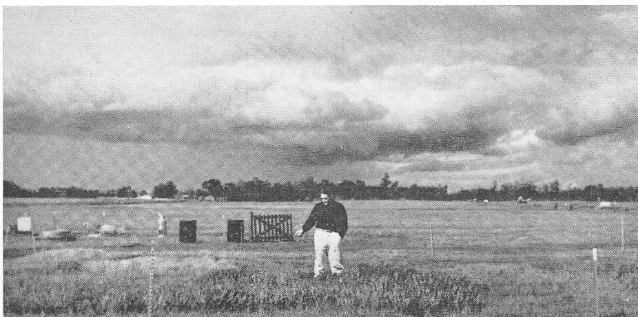
Growth of forage in response to various fertilizers. Left—nitrogen, 150 pounds per acre; center—nitrogen, 150 pounds, plus phosphorus, 200 pounds per acre; right—no fertilizer.

The above progress report is based on Research Project No. 4635.