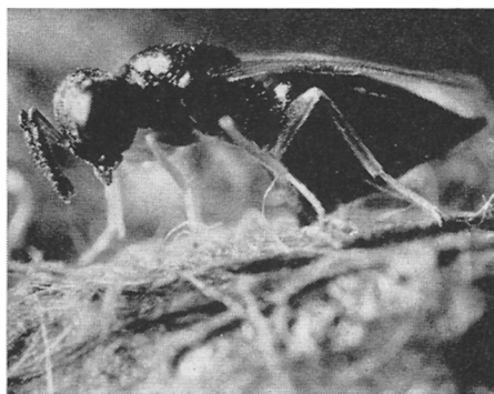
Female parasite probing her host with her ovipositor.

The female Dibrachoides attacks by probing through the weevil cocoon with her ovipositor and stinging the contained prepupa or pupa. The sting paralyzes the host and the parasite may then deposit