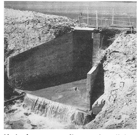
Limited water supplies require efficient irrigation.

In one test plot, to be used as a check, the soil was irrigated with a depth of water and a frequency according to good local practice, so that throughout the growing season the moisture content of the soil always exceeded 30% of the total