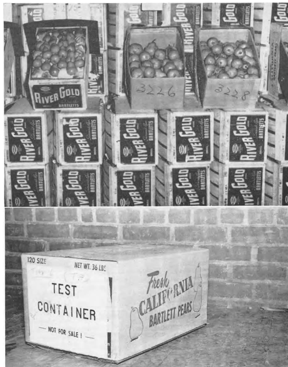
Top photo shows a test shipment of both the old and new style containers for fresh pears at an eastern market. Lower photo shows closeup of the new container.

Economic and engineering analyses were used to determine the least-cost method of performing the various plant operations with these alternative packing methods. Efficient plant organization with any particular method is assumed in the cost calculations. With the wrap-pack standard box and the bulk-filled carton the equipment, labor, and other services required were determined from studies of actual plant operations. The bin-type