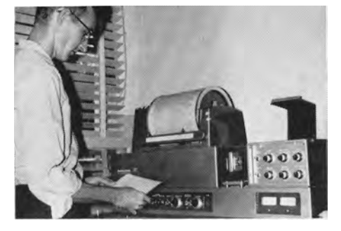
Infra-red spectrophotometer "fingerprints" an insecticide by making a graphic recording of a spectrum of a compound on punch cards for quick identification of future samples.

use under specified conditions. These facts indicate the thoroughness of University investigations to safeguard our food supply and public health. Methods of analysis of toxic compounds are now in use by which the most minute traces of a chemical can be detected—less than one part per billion in some instances.