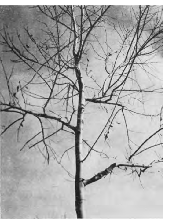
Above—six-year-old tree showing angle of attachment of lateral branches growing from secondary buds after removal of sharp-angled branches from primary buds. Street tree in Modesto.

Further studies are being made to determine the best pruning pattern to follow but this preliminary report offers nurserymen, landscape horticulturists, and the public one simple solution for averting a dangerous branch structure in the Modesto Ash.