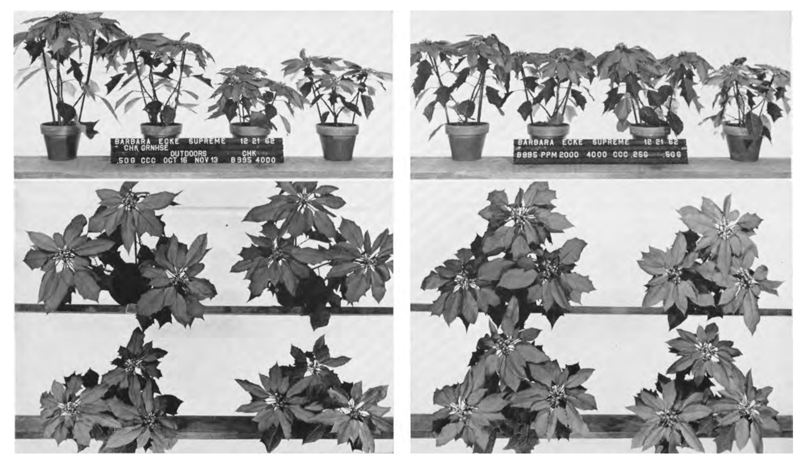
CALIFORNIA AGRICULTURE, JUNE, 1963

Side view of representative poinsettia plants of two CCC and two B995 treatments showing relative height and foliage density. From left to right, treatments 7, 8, 2 and 3. Top view of same plants illustrating relative showiness of bracts. Top, left to right, treatments 2 and 3; bottom, left to right, treatments 7 and 8.