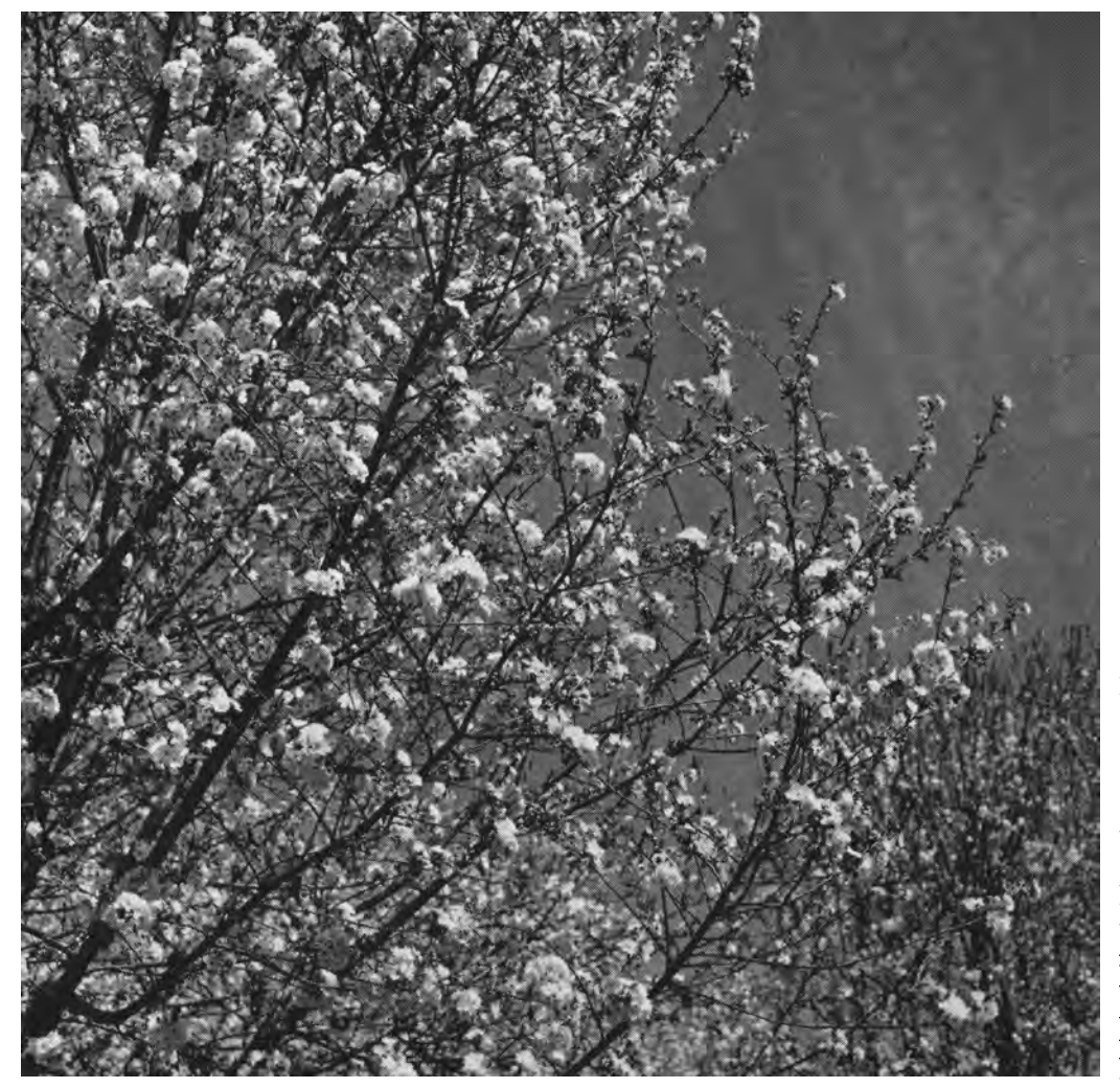
Almond flowers are most receptive to effective cross pollination for a day or two after they open and remain receptive for only three or four days, under favorable weather conditions.

Timing is critical for EFFECTIVE CROSS POLLINATION OF ALMOND FLOWERS