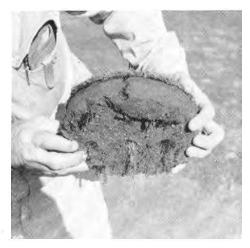
Section of turf shows good grass root growth through backfilled material in drilled holes in renovation test.

had been applied during a 30-minute irrigation. After treatment, casual water showed up after an hour's irrigation only on the control area and on a very small area in the northwest portion of the green where slope was a problem.