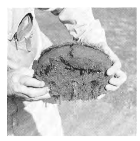
Section of turf shows good grass root growth through backfilled material in drilled holes in renovation test.

had been applied during a 30-minute irrigation. After treatment, casual water showed up after an hour's irrigation only on the control area and on a very small area in the northwest portion of the green where slope was a problem.