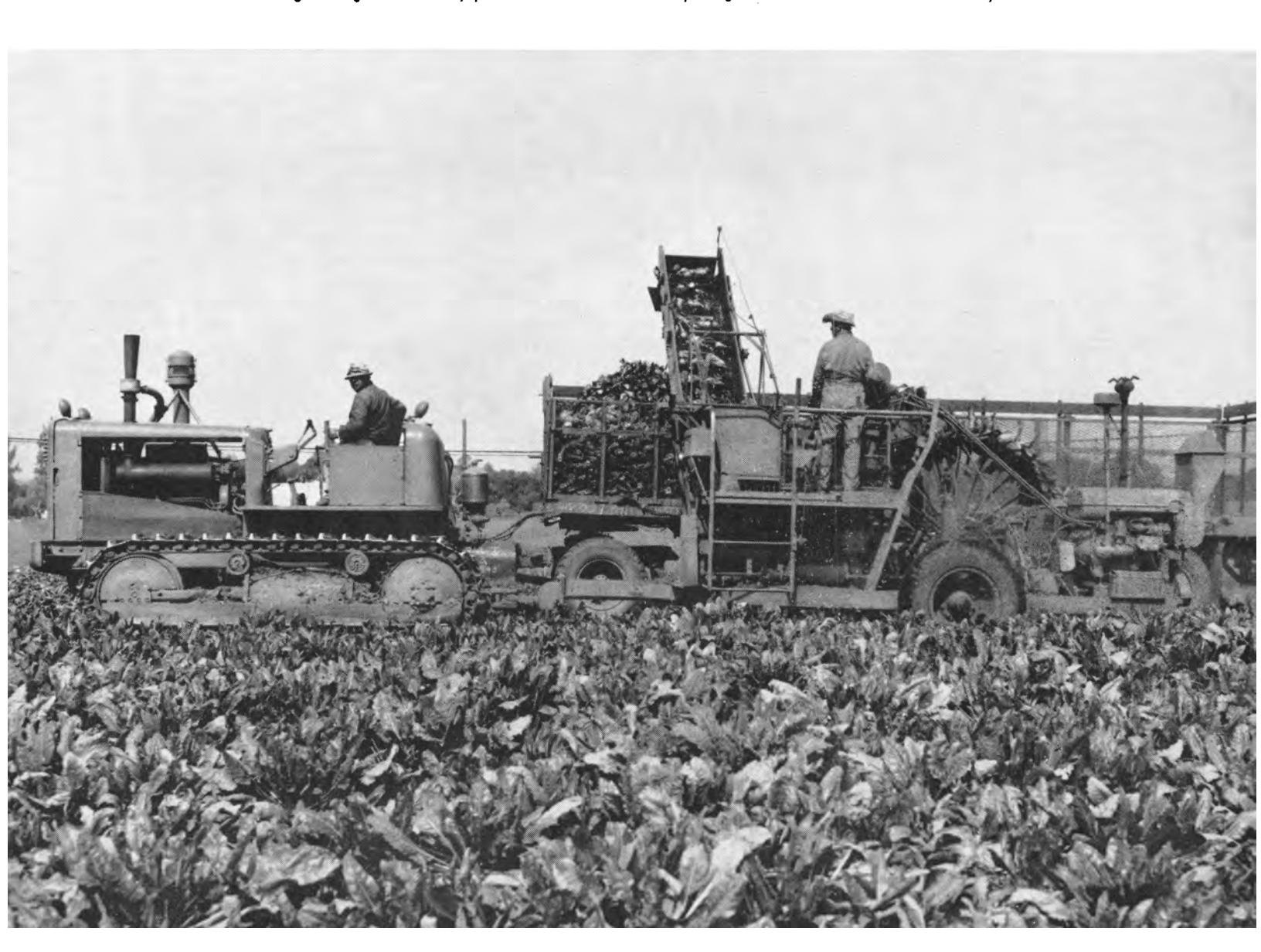
The US H7 monogerm sugarbeet variety planted to a stand (6 inch spacing near Salinas and hand hoed only one time.

The bolting resistance of US H6 is adequate to meet the requirements for early plantings in most sugarbeet-growing districts of the State. The curly-top resistance of the variety is similar to that of US H2 and superior to that of US 75. In 74 statewide variety tests, US H6 produced an average of 17% more sugar per acre than US 75, and the sucrose content was one-half percentage point higher. The variety is recommended for both winter and spring plantings in