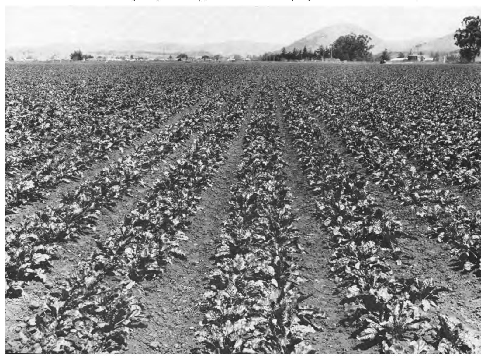
The US H7 monogerm sugarbeet variety planted to a stand (6 inch spacing) near Salinas and hand hoed only one time.