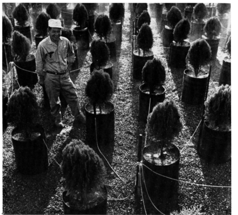
Nine ½-inch plastic tubes water nine containers from one valve.

inch plastic tubes. Assistance with design of the system was obtained from the extension irrigationist, University of California, Davis, and the Sacramento County Farm Advisors' office. Each master unit of the system is operated by a 3-inch, electric-clock-controlled valve and is designed to irrigate 720 containers in five minutes. The 15-gallon containers are placed on 4-ft centers, so that the area covered is 16 \times 720 or 11,520 square ft, excluding roads and driveways.