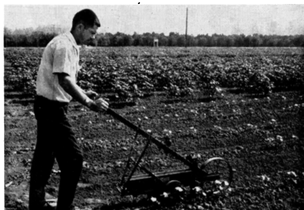
Placement of a granulated systemic insecticide into the soil in a band alongside the cotton row is one of the preferred methods of application. Only the most promising chemicals from the greenhouse receive field attention.