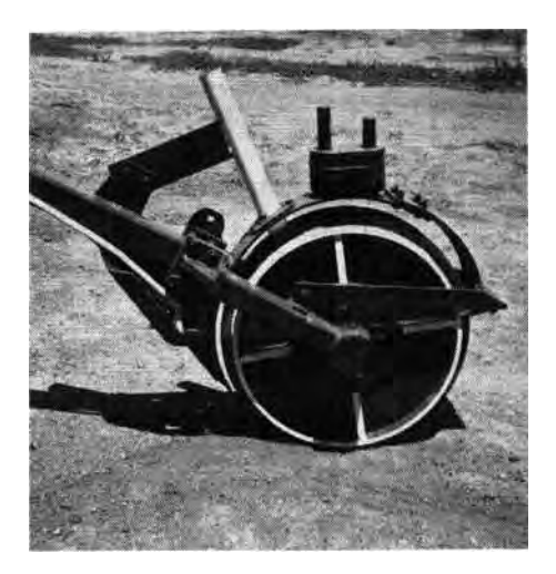
Closeup of the twenty-inch, double disk opener. Note the spray nozzle and depth rings. This unit weighs 188 lbs.

The fertilizer attachment on a standard grain drill delivers either granular or pelleted fertilizers, which allows single superphosphate to be applied to the soil surface in a band approximately six inches wide immediately ahead of each opener. Thus equipped, the rangeland drill can control weeds, fertilize, and plant