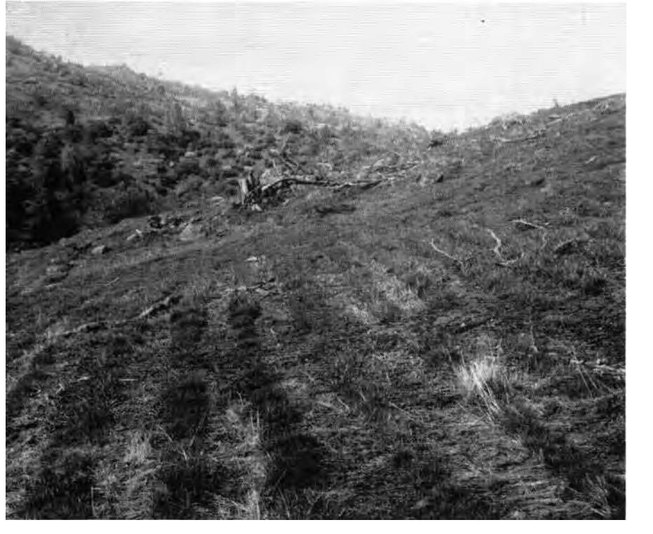
Resident vegetation is killed in bands and seed planted in the center of these bands. The remaining vegetation controls erosion during establishment period. Sierra Foothill Range Field Station.

Millions of acres of California rangelands that could otherwise be improved by reseeding are located on terrain that is steep, erodable, or too rocky for cultivation. Recent research has shown that these ranges can be successfully seeded by spraying the resident annual vegetation with paraquat and planting immediately. Spraying in bands was shown to give adequate weed control. Special seeding equipment has been developed to allow spraying, fertilizing, and planting in one operation on any terrain that can be traversed by a crawler tractor. This article is a progress report of experimental use of paraguat on California rangelands. Further investigation is necessary before federal registration or University of California recommendation will be granted for use of this herbicide on rangeland.