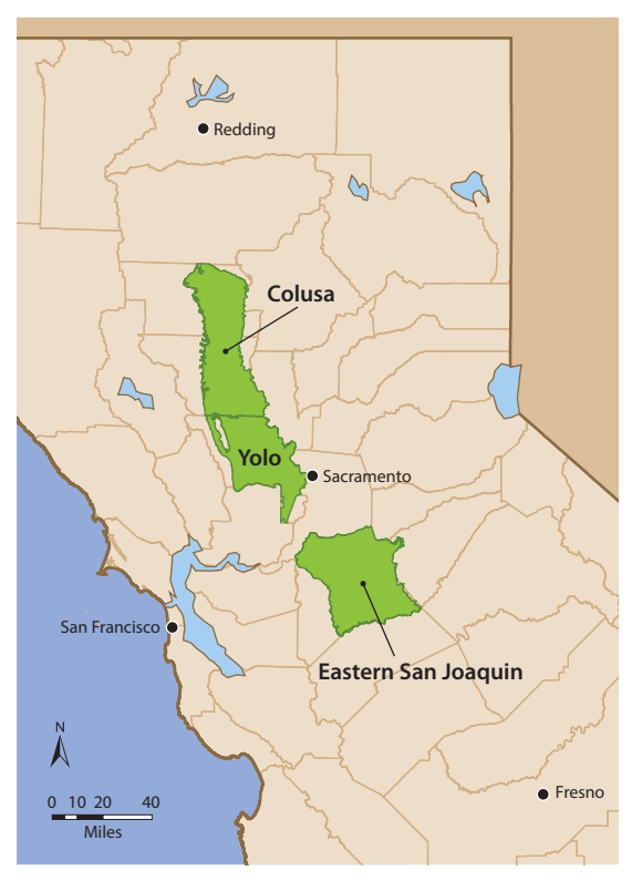
FIG. 1. Case study groundwater basins.

decision-making within the GSA or in coordination at the basin scale.