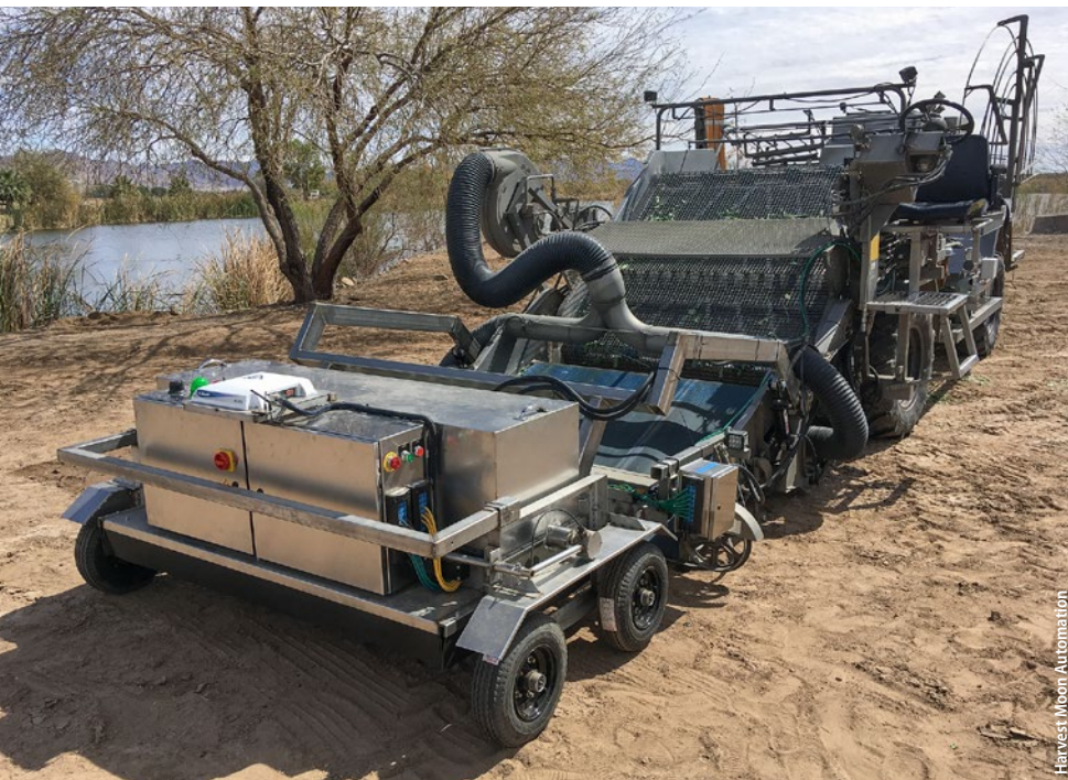
Harvest Moon Automation

This modified leafy greens harvester, developed by Harvest Moon Automation in partnership with two Salinas Valley growers, uses a camera and pattern-recognition technology to spot foreign objects and diseased or damaged plants. A mechanical arm pushes such contaminants out of the way of the harvesting blades, so they are left in the field instead of being fed into the processing line.