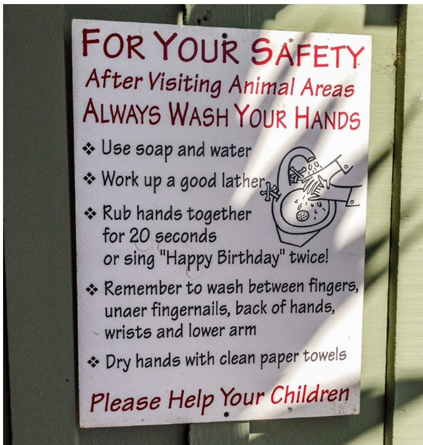
FIG. 1. Example of handwashing signage at the California county fairs included in this study.

We conducted this observational study at four county fairs across the state of California during the summer months (July, August, September) of 2015. The fairs were located within two geographic regions of California, the Central Valley (two fairs) and the Central Coast (two fairs). We observed fair visitors specifically for handwashing practice at barns containing livestock. Barn setups varied; some barns contained exhibition animals, others contained animals in petting zoos. However, all observation sites consisted of pens that kept livestock separated from visitors, walkways for visitor traffic and an entrance and exit. Handwashing (sink or alcohol-based hand sanitizer) stations were present at the exits of all barns where observations were made, and handwashing signage was present in some, but not all, barns.