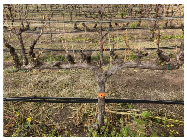
Grapevine spur positions were pruned to three 1-foot-long buds in early March 2019.

highlighted that some biofungicides in this trial were not effective in controlling both pathogens. For example, Bio-Tam + CrabLife Powder had 100% disease control of E. lata , yet this combination only had 3.85% MPDC of N. parvum (table 2). Inversely, Vintec had 100% disease control of N. parvum but only 23% MPDC of E. lata . Similar results were reported by Rolshausen et al. (2010) where biopaste was very efficient in controlling E. lata but did not control species in the Botryosphaeriaceae family.