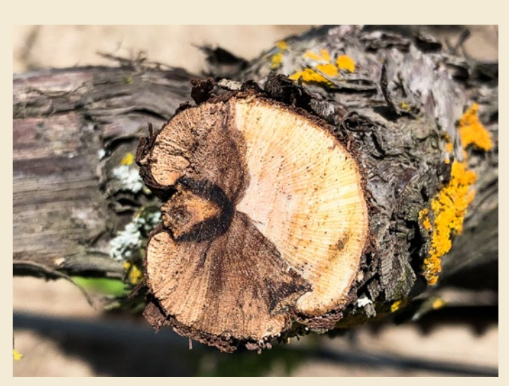
Botryosphaeria canker.