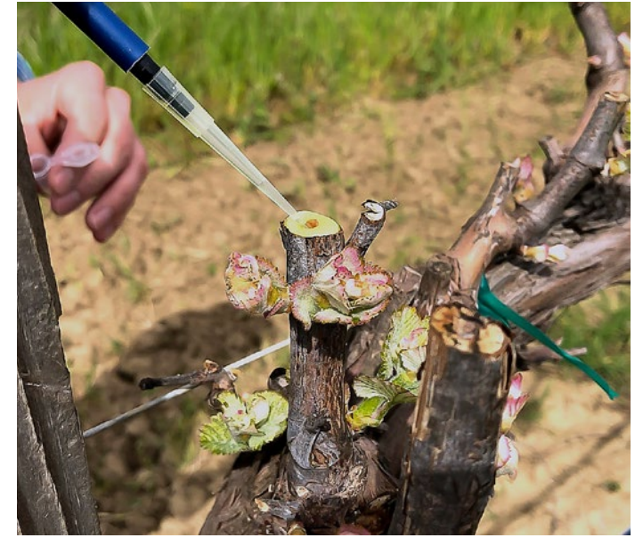
Fungal inocula were applied to pruning wounds following application of liquid treatments.

We collected dead wood from grapevine trunks naturally infected with stromata of E. lata in a vineyard in Lodi, California. After releasing fruiting bodies (ascospores) from 5-centimeter-long wood segments (as described by Carter 1991), we adjusted the ascospore concentration to 2.5 \times 10^4 ascospores/mL. We also collected dead grapevine wood with fruiting bodies (pycnidia) of N. parvum from naturally infected grapevine trunks in the same Lodi vineyard, and we adjusted the concentration to equal that of E. lata : 2.5 \times 10^4