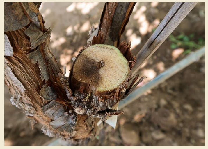
Wedge-shaped Eutypa dieback canker.