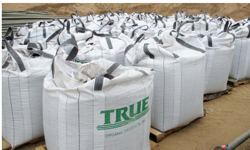
Bulk delivery of organic fertilizers.

application rates are often at or above these N uptake values. However, as will be discussed below, the net amount of N released from organic fertilizers during the crop cycle is less than the total N content of the crop. Over all sites, the amount of N released from applied fertilizer was less than crop uptake: average crop uptake was 97 lb N/ac and the average net release of N from applied fertilizer was 83 lb N/ac (table 1). It appears that the other sources of N, such as residual mineral N, mineralization of N from soil organic matter, and nitrate-N in irrigation water, while modest, were sufficient to supplement fertilizer N to achieve economically viable yields.