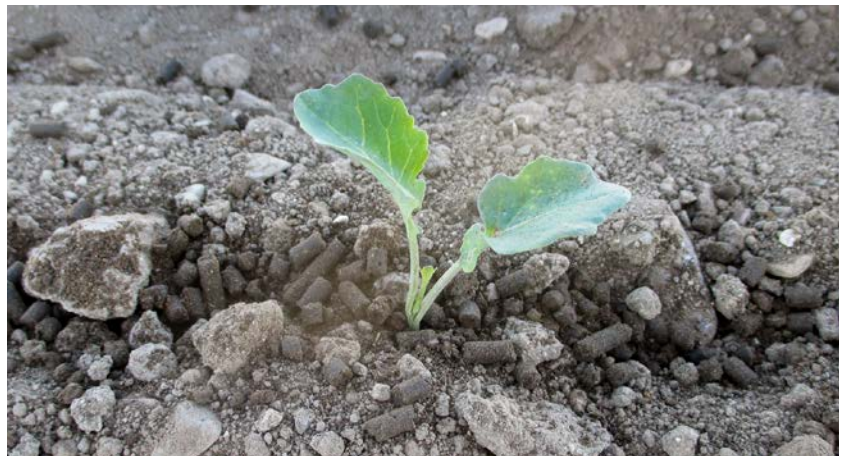
Pelleted organic fertilizer in a broccoli field.