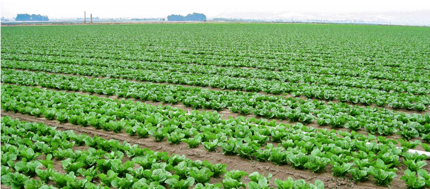
Lettuce mid growth cycle.