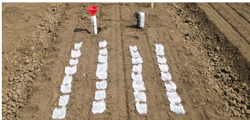
Polypropylene mesh bags containing organic fertilizer were placed on the soil surface to simulate a topdressed application.