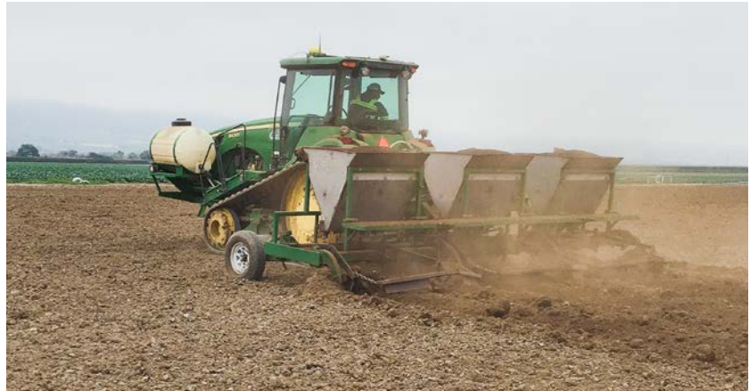
Tractor applying fertilizer.