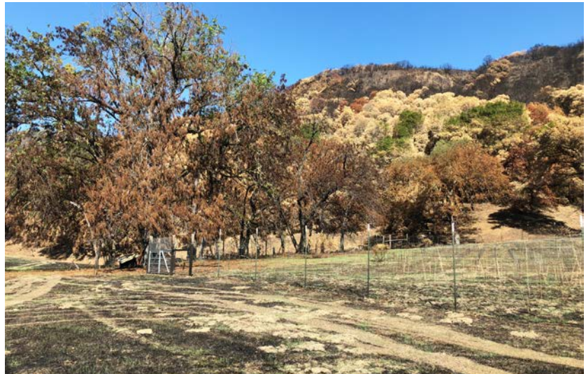
A view of Hopland Research and Extension Center in October 2018, after the River Fire, before pasture regrowth.

Twenty-eight water samples were obtained after completion of 2019 grazing, from all animal drinking water sources available (including natural and man-made) for each pasture grazed by the POST lambs. Water was collected by dipping sterile polypropylene plastic containers directly from the water source where it was available to the sheep, and samples were immediately frozen at -68^{\circ}\text{F} ( -20^{\circ}\text{C} ) to minimize changes