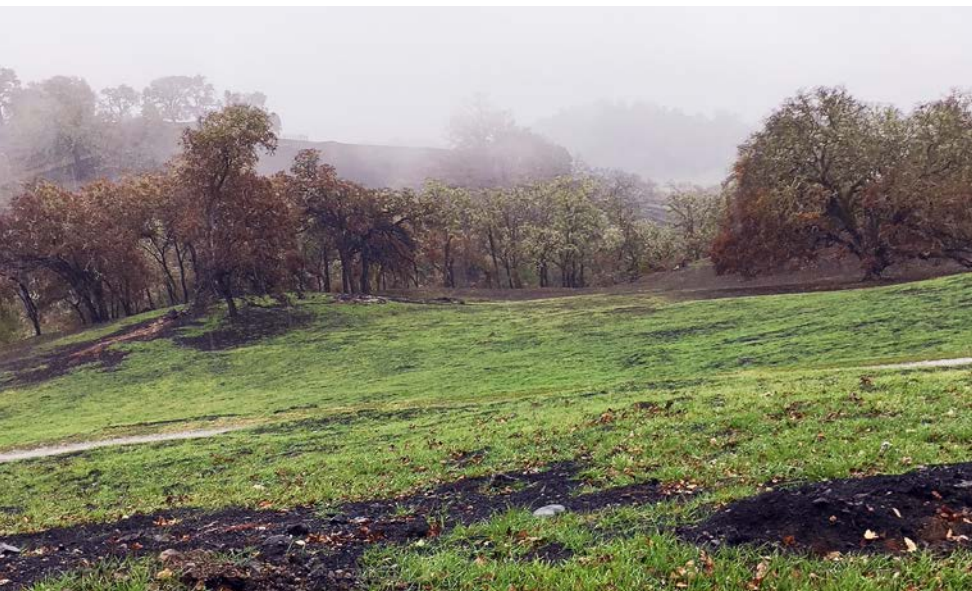
Burn regrowth at the Hopland Research and Extension Center, December 2018. Researchers did not detect lead, mercury, arsenic, molybdenum, cadmium, beryllium, cobalt or nickel above reporting limits in any meat or wool samples.