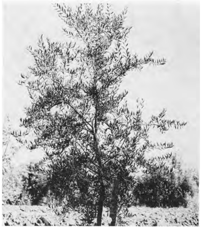
Four-year-old 'Swan Hill' fruitless olive tree, grafted on Mission olive rootstock.

... a new ornamental fruitless olive for California