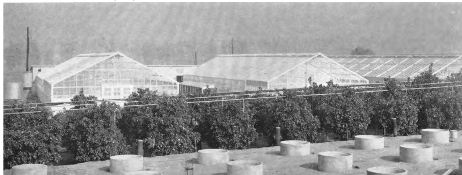
(4) The “tank orchard” of trees growing in nutrient solutions at the Citrus Experiment Station (1958).

Tests of fruit quality revealed some differences related to iron nutrition, most of them small enough to be unimportant.