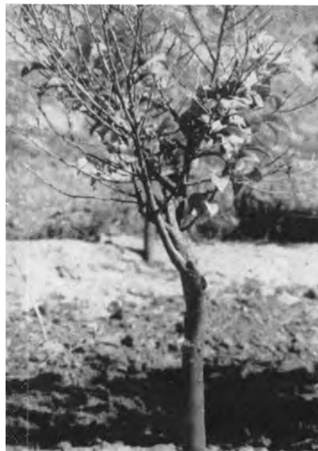
(3) Crown of a young lemon tree almost completely killed by iron deficiency.

Photo 5 shows orange leaves having a range of iron concentration from 11 ppm to 43 ppm. This represents nearly the full range of leaf symptoms that can be shown