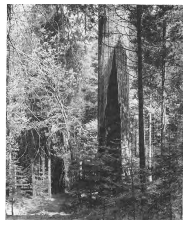
Understory of white fir around giant sequoias at Whitaker's Forest.