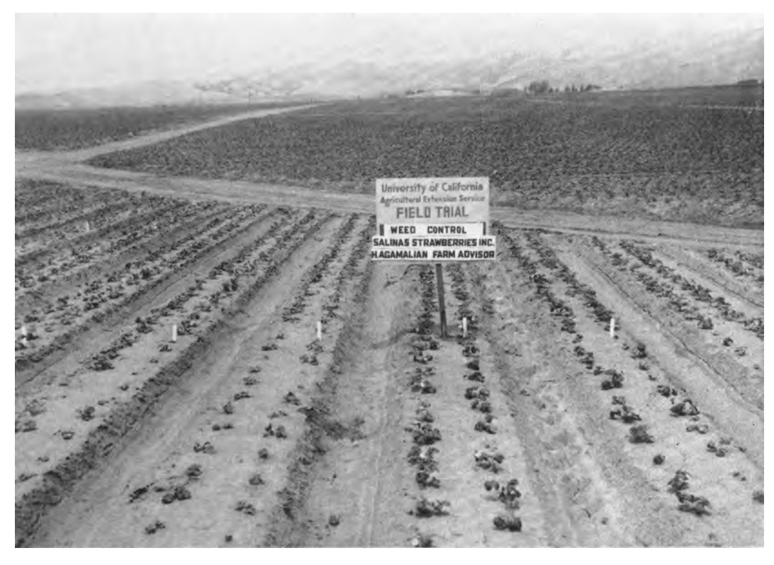
Strawberry weed control test plots, above and cover photo, Monterey County, show weed-free rows of plants resulting from use of DCPA (in bed with the sign) and diphenamid (in bed left of sign).

PRESENT-DAY strawberry culture demands a field clean of weeds. This is particularly true in some areas of California where the practice of covering beds with a clear polyethylene film for several months (beginning usually in January or February) creates a unique problem from the standpoint of weed control. Weeds grow rank under clear polyethylene, and hand labor for weed control underneath the film is costly. The combination of a long harvest period plus the fruit's proximity to the ground places a high value on minimum cultivation.