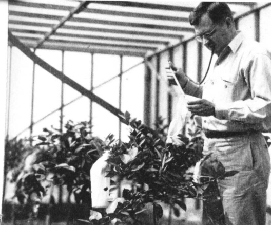
Transferring leafhoppers into a sleeve cage on a test tree.