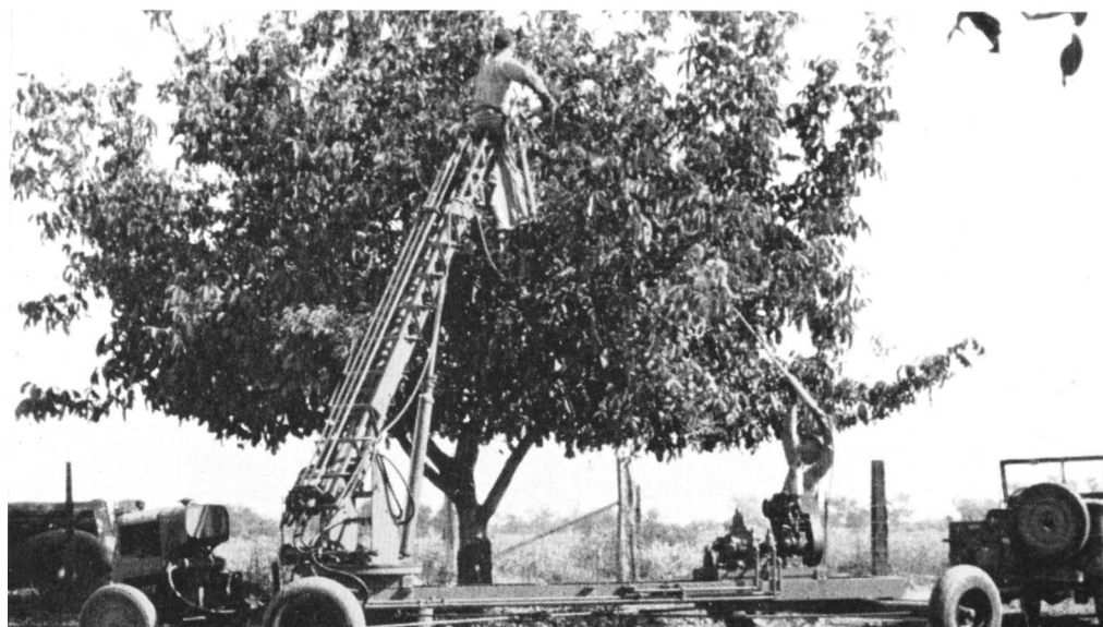
Pneumatic knockers, or limb-shakers, in the hands of skilled operators speed up mechanized harvesting.