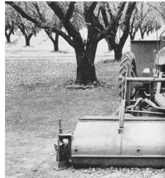
Newly designed prune catcher is pushed by tractor onto conveyor belts to be carried to storage