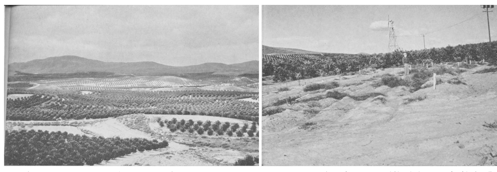
Looking west into Eagle Valley, Riverside County, Trees are from four to 10 years of age. Young trees west of Lake Mathews where excessive soluble salts have accumulated in the soil.

installed in Woodcrest or areas south to Eagle Valley. Most of these soils have been classified as Fallbrook sandy loam. Below about 18 inches, the soil has some increased amounts of clay. On this type of topography, small acreages have been "salted out." Trees growing on soil at higher elevations do well, but water and salts moving down the steep incline at the interface of the soil and bedrock have accumulated in relatively flat locations, as shown in the photo.