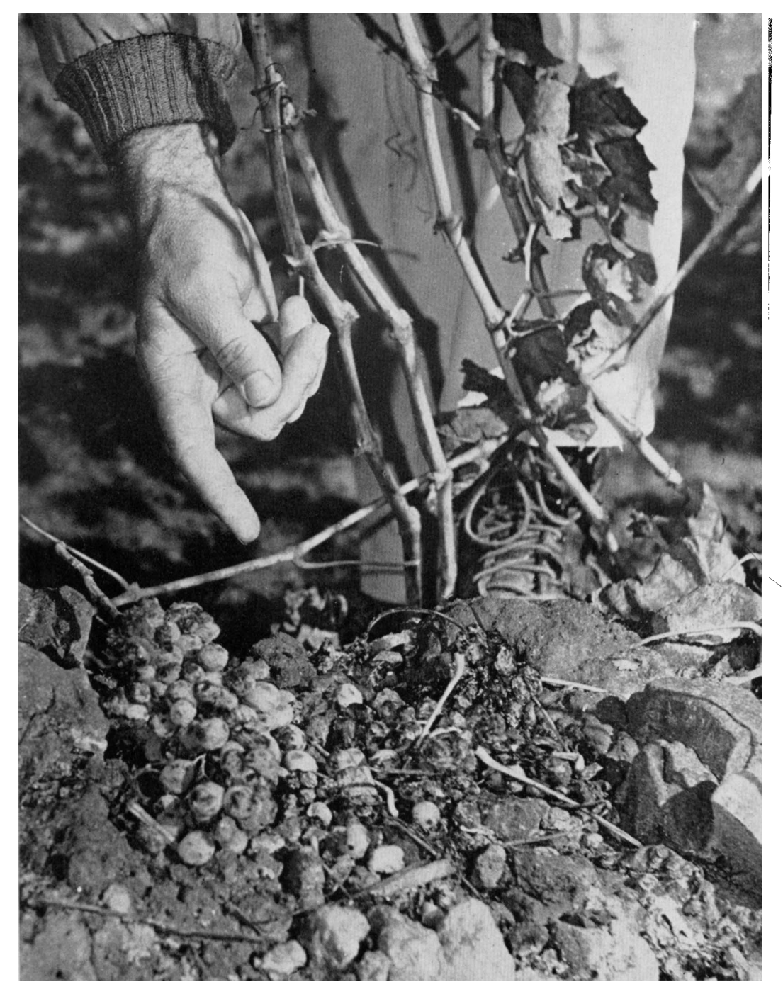
Rotten and mummified grape clusters provide excellent overwintering sites for the omnivorous leaf roller. Herbicide treatment where the soil is left undisturbed in the vine row may have created a large reservoir of overwintering sources from which infestation will occur in the spring.

Studies made during the 1968 season showed that Platynota can complete its life cycle within the mummified bunches, or the larvae can leave overwintering sites in early spring and move on to shoot tips, leaves, and flower clusters where they form nests and pupate. Larvae of the first brood appeared in early May in 1968. Most of these formed nests in the cluster forms. The second brood larvae first appeared in late June, the third brood in late July, the fourth brood in late August, the fifth brood in late September and a sixth brood in early November. There was considerable overlapping of broods although there were definite peaks.